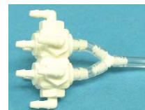
MMF-8: 8 to 1 Minimanifolds™