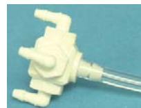
MMF-4: 4 to 1 Minimanifolds™

Minimanifolds™ are available in 4 to 1 or 8 to 1 versions. They are designed for bath solution exchange. They are made of ABS plastic. The inlet / outlet connections are made with 1/16" barbed fittings and connect to standard components. The MMF's come as a standard part in all of ALA BPS and SPK perfusion systems.